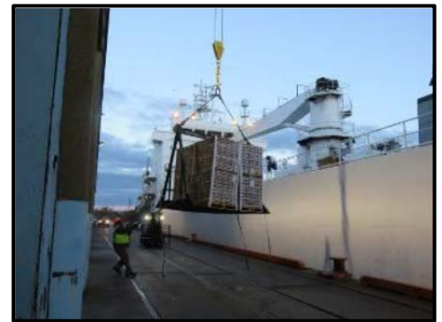
Discharge of Clementines from the MV GREEN ITALIA into the Port of Wilmington